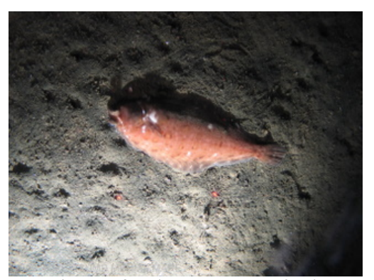
Figure 4. Dover Sole ( Microstomus pacificus ).