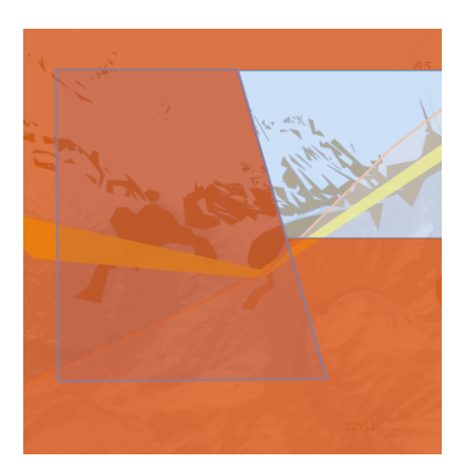
Figure 2. Close-up map of SESA 6. Grey border=SESA boundary (left); yellow=Rockfish Conservation Area; light orange border=EFH Conservation rea; orange=commercial benthic fixed gear dominant use; light blue border=State MPA(right).