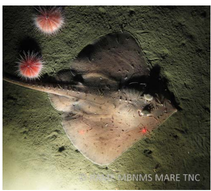
Figure 3. Fragile pink urchin ( Strongylocentrotus fragilis ), Sandpaper Skate ( Bathyraja interrupta ).