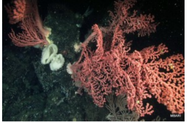
Figure 5. Bubblegum coral ( Paragorgia arborea ) extending out from cliffs into the uprising currents so the colony of polyps can feed.