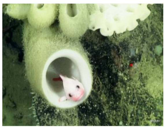
Figure 3. Snailfish (Liparidae) rests inside of a sponge near the summit of Sur Ridge. Credit: MBARI (http://sanctuarysimon.org/photos/index.php).

• SIMoN Photo Library (http://sanctuarysimon.org/photos/index.php)