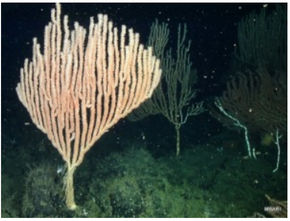
Figure 4. Bamboo coral (Isididae) is an upright branching soft coral that acts as a foundation species for other benthic megafauna.