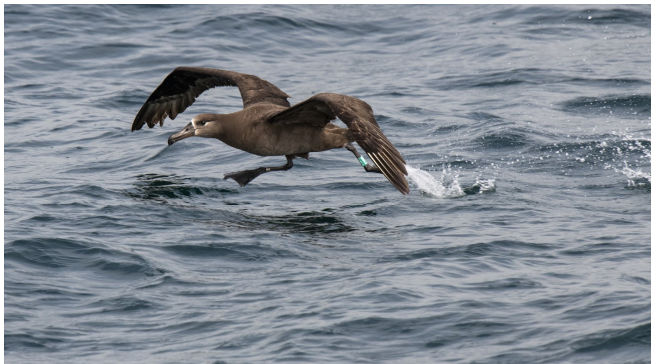
Black footed albatross and other predators, like whales and sea lions, could be affected by impacts to prey due to changing oceanographic processes.

Climate change is altering large-scale processes such as atmospheric circulation and El Niño . During El Niño events, the sanctuary experiences large waves, increased rainfall, reduced upwelling , and warmer water. 61,62 These effects could intensify in the future as the frequency and intensity of El Niño events are expected to increase. 38 The winds that drive upwelling are also expected to become stronger, increasing the frequency and intensity of upwelling, which could escalate ocean acidification. 32,33