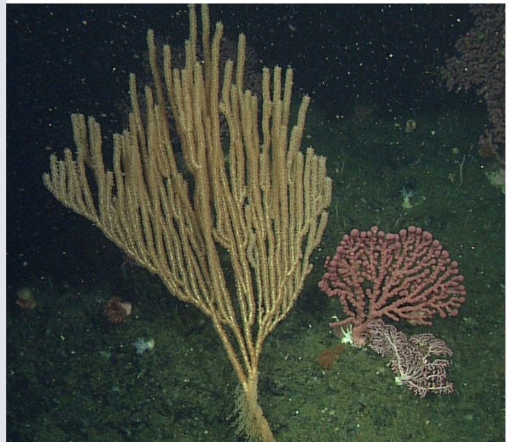
Increasing water temperatures could create conditions that are too warm for some deep water coral communities.

Globally, increasing temperatures are the primary cause of sea level rise through melting glaciers and thermal expansion of seawater. 1 Rising waters could threaten coastal habitats in the sanctuary including the salt marshes of Elkhorn Slough, 24 which are important for coastal protection and carbon sequestration , and beaches that are critical nesting and haul-out habitat for mammals like northern elephant seals and sea birds like the threatened western snowy plover . 25