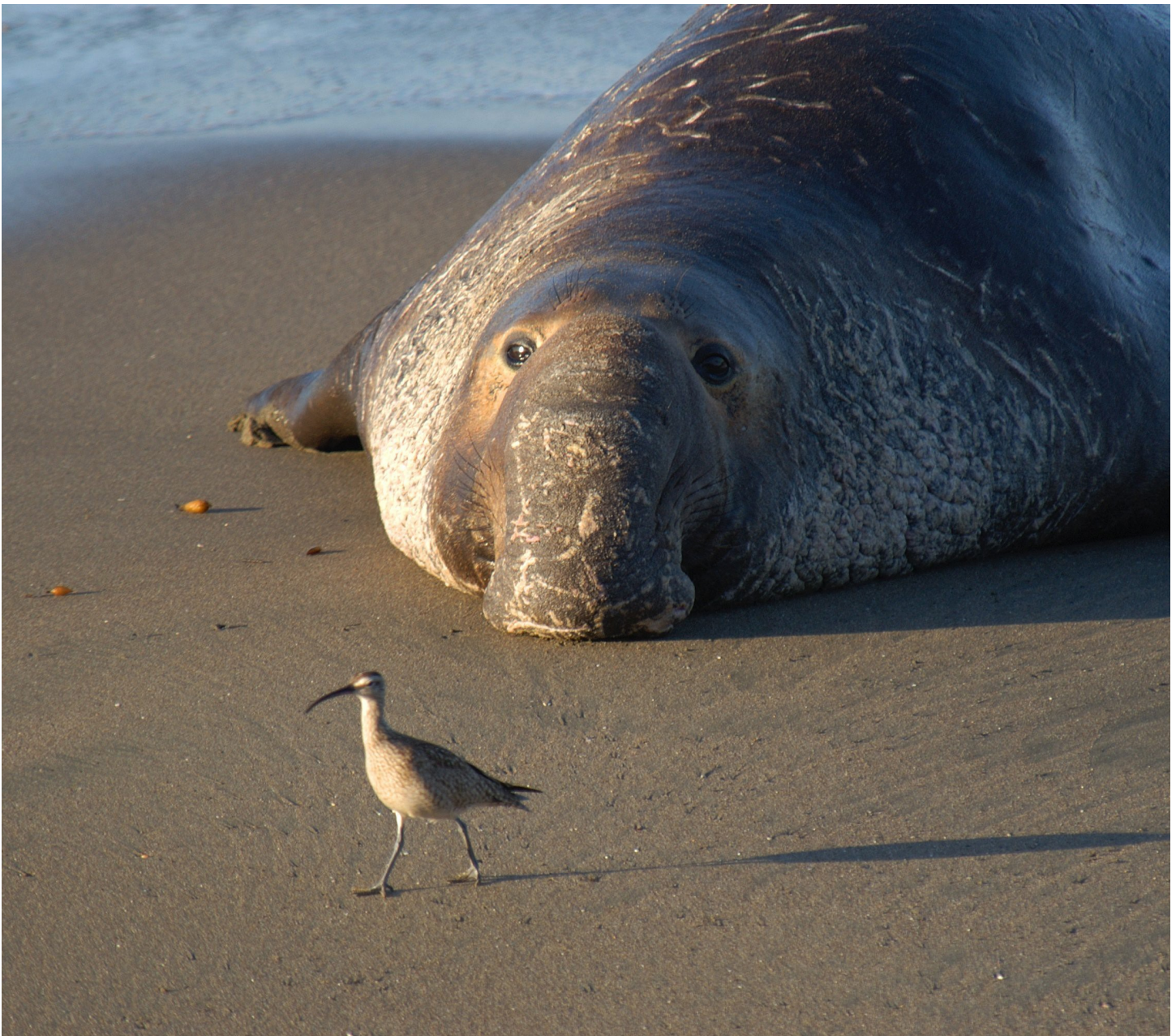
Northern elephant seals are just one of the many iconic species protected by the sanctuary.

Sanctuary staff and managers also actively participate in outreach and education with local and regional communities. NOAA incorporates climate change into its training of volunteers and its outreach and education materials and presentations. Through these efforts, NOAA is increasing public understanding and awareness of the impacts of climate change.