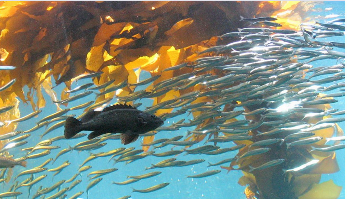
The vibrant kelp forests of the sanctuary provide habitat for hundreds of species.

While kelp may help mitigate climate change through carbon burial, it is not immune to its impacts. Warming waters can reduce kelp survival and reproduction 10,11 and kelp can be damaged by the strong waves associated with El Niño events, 7 which are projected to increase in frequency and intensity. 38 Kelp can also be impacted by ecological changes triggered by climate change. 39 In fact, anomalously warm waters from 2012-2016 appear to have contributed to a cascade of ecological events leading to the loss of 90% of the kelp canopy cover in some northern areas of the sanctuary. 39,40 This loss impacted species like rockfishes and sea otters and led to the closure of the valuable recreational red abalone fishery in 2018. 14 While climate change likely played a role in the kelp die off, 10,11 the immediate cause was a boom in purple sea urchin population. Ecological cascades, such as the sea urchin population boom and its impacts on kelp and other species, and other ecological changes, like shifting species, are likely to continue as the climate continues to change. These changes, together with other climate change impacts, could continue to alter kelp forest ecosystem functions and services.