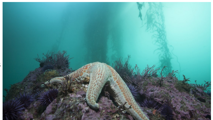
Sea stars are just one of the many organisms that could be impacted by rising water temperatures.

Rising temperatures and marine heatwaves can cause mortality events of intertidal organisms, such as mussels and oysters, and may increase the incidence of sea star wasting disease. 5,6 Further, warmer waters hold less oxygen and may cause oxygen concentrations to fall below the range of natural variability by 2030, 7 reducing habitat for rockfishes 8 and negatively affecting deep water corals . 9 Warming waters may also reduce the survival and reproduction of kelp 10,11 and create conditions that are too warm for some deep water corals. 12 Warming may force species in the