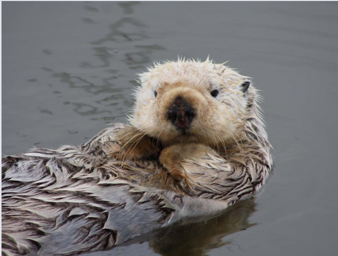
Sea otters are one of the many species in the sanctuary that depend on kelp forests.

The vibrant kelp forests of the sanctuary are home to hundreds of ecologically, economically, and culturally important species including rockfishes, abalone, and sea otters. Kelp forests also act as “ blue carbon ” habitats. As kelp grows, it stores carbon in its structures. As pieces of kelp break off, they can float up to 150 miles offshore 34 and sink to the deep ocean where their carbon can be buried for thousands or millions of years. 36 In the sanctuary, more than 100,000 tons of kelp can be transported through offshore canyons to the deep sea every year. 35,36 Globally, kelp and other macroalgae could sequester 200 million tons of carbon annually, 35 more than 35 times the annual emissions of San Francisco. 37