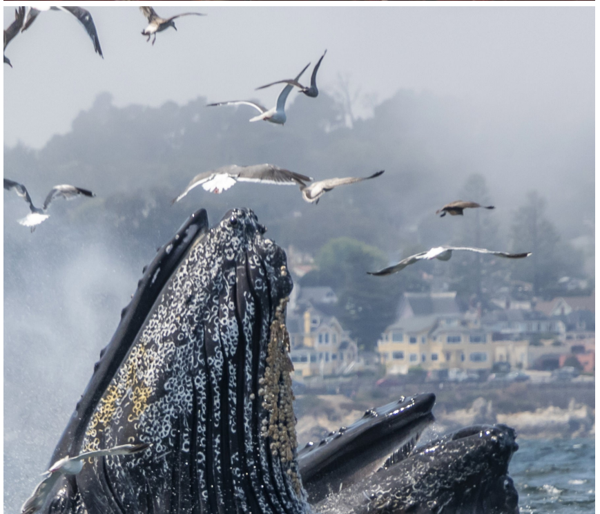
The sanctuary protects a great diversity of life, much of which is impacted by climate change. Species IDs (top to bottom): Pinot abalone, opalescent nudibranch, feeding humpback whales.