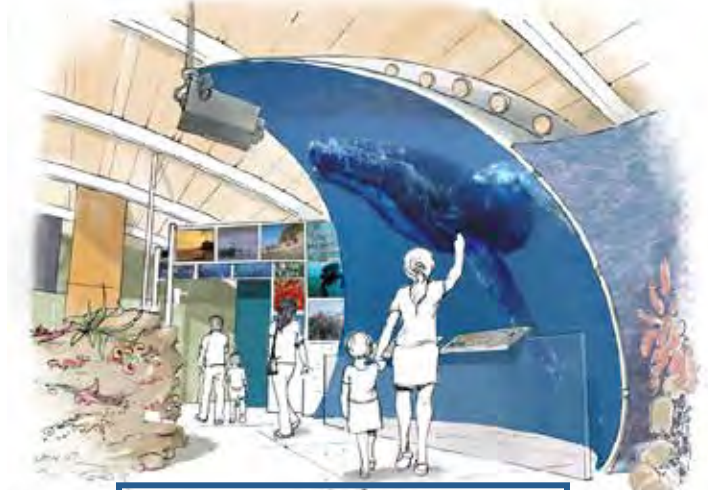
Walk thru Theater