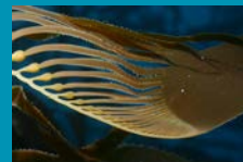
Giant kelp ' Macrocystis ', the growing edge