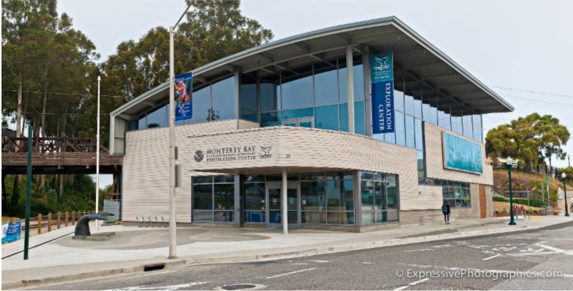
Sanctuary Exploration Center