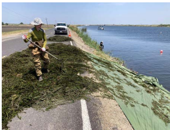
Several hundred pounds of the invasive plant were removed by divers and snorkelers.