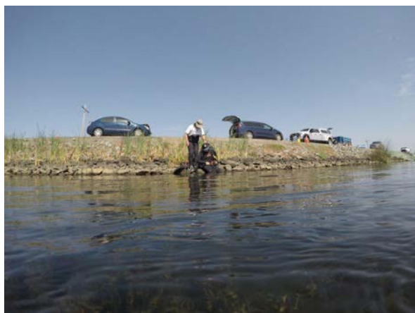
Tom Laidig assists diver LTJG Jaime Hendrix at the edge of the levee. The water was 65 F but the ultra fine silt created clouds of zero visibility as plants were removed by hand.

On April 26, 2002 Dr. Steve Lonhart dove with NMFS scientists to remove an invasive aquatic plant, Egeria densa , from the Middle River of the delta near Stockton, CA. NMFS scientists plan to “test the effects of invasive submerged aquatic vegetation on fish communities and predation risk in the California Delta. We intend to electrofish and use our predation event recorders to sample a study site before and after a vegetation removal to see if the removal results in changes in predation risk or fish community.” Three divers assisted with manual plant removal along the bank of a levee, creating three 50-m stretches without the invasives. NMFS required diving support from ONMS, and as part of our ongoing diving collaborations, we were happy to assist. This experiment may determine if more management of the invasive aquatic weed is needed in areas to support survival of specific fish species.