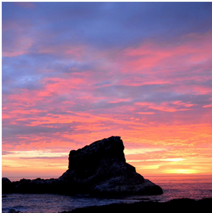
Sunset over Piedras Blancas, Monterey Bay National Marine Sanctuary.