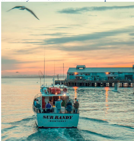
Sur Randy leaving the harbor.

Located on the historic Fisherman's Wharf in Monterey Harbor, J&M Sport Fishing offers daily fishing adventures throughout the year on our two boats, Sur Randy and Chabasco . Our trips are suited for first time anglers, all the way to seasoned veterans. We fish for different species during different seasons.