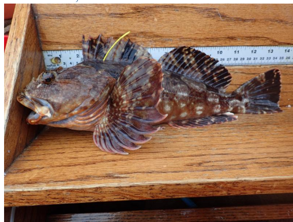
A Cabezon being measured before release.

Instagram: https://www.instagram.com/ccfrp/