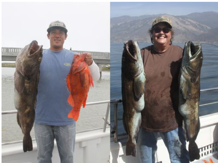
Super Kahuna catches!

Special Announcement! The Kahuna is now in the boatyard being outfitted with new, more powerful engines and will return to service in Monterey Bay at the end of February (this month.)