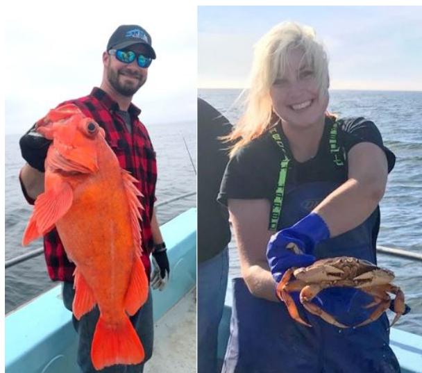
Happy anglers with J & M Sportfishing.

CCFRP has been conducting surveys along the central California coast since 2007, when the network of MPAs was established in this region. From 2007 to 2016, the research groups from Moss Landing Marine Laboratories (MLML) and Cal Poly San Luis Obispo (CP) utilized 12 Commercial Passenger Fishing Vessels (CPFV) and more than 900 volunteer anglers over 325 sampling days at sea to tag and release over 82,000 fishes from 52 different species, tagging over 40,000 of those individuals prior to release.