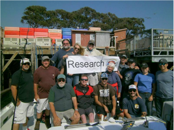
Participants in the fisheries research project.