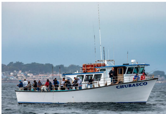
Fishing aboard Chubasco .

dock. If other fisheries become productive in the bay, such as tuna, halibut, white sea bass, etc., we will open up trips and notify interested anglers with our Fish Alert system. To sign up, add yourself to the contact form on our website and choose which fisheries you want to be notified about.