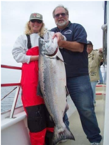
Great salmon fishing aboard the Queen of Hearts .