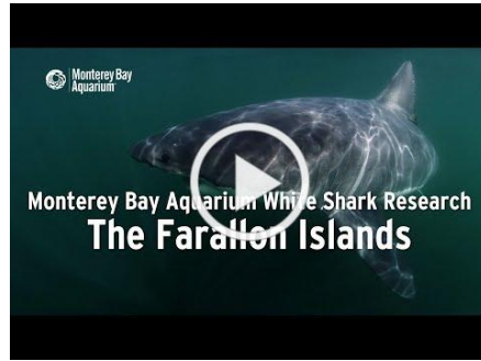
Project White Shark - The Farallon Islands

White sharks return to Farallones "lunchroom" - public advised to avoid disturbing them. On September 21, Greater Farallones National Marine Sanctuary issued a Superintendent's Statement to advise the public that white sharks have made their annual appearance in Greater Farallones National Marine Sanctuary off San Francisco, and that they are protected from disturbance from boats, wildlife watchers, and other activities.