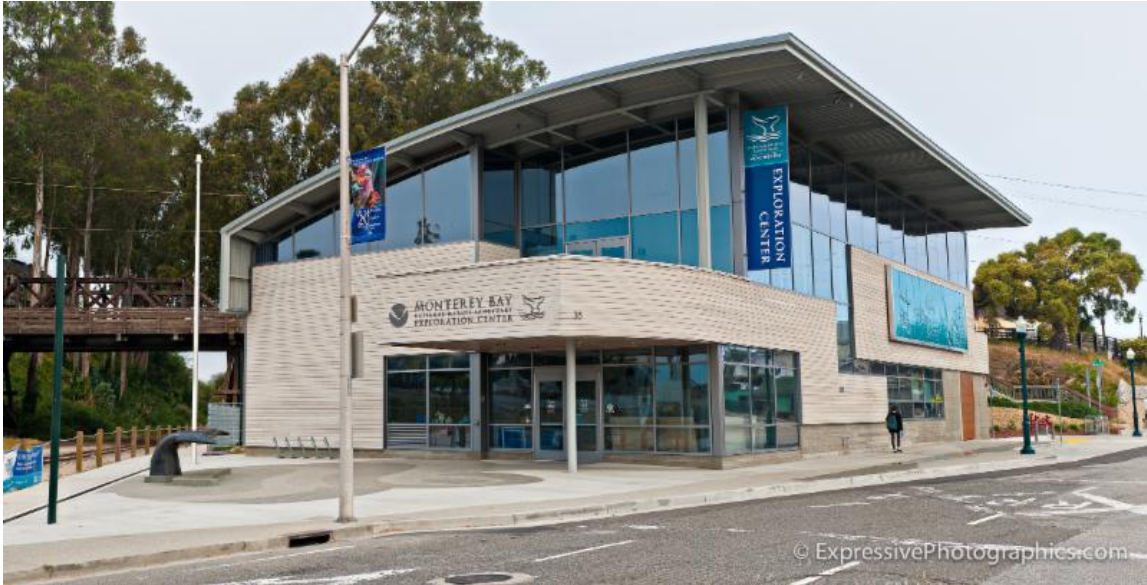
Sanctuary Exploration Center

Hours: Open Wednesday through Sunday, 10am - 5pm (Closed Monday and Tuesday)