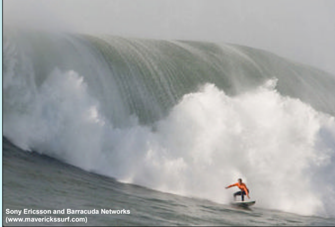
Sony Ericsson and Barracuda Networks (www.maverickssurf.com)