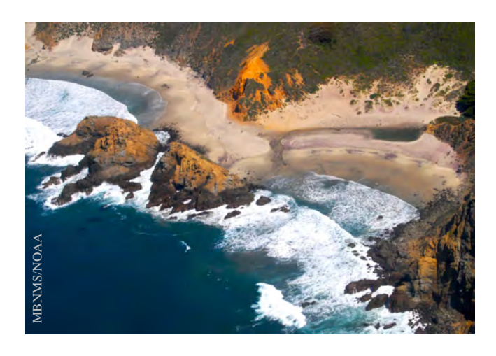
Wreck of Airship USS Macon Added to National Register of Historic Places

motorized personal watercraft compliance, shipping lane compliance, state marine protected areas compliance, aircraft zone compliance, coastal construction, historical site protection, vessel patterns, discharges, oil sheens, river flows, turbidity plumes and species assemblages.