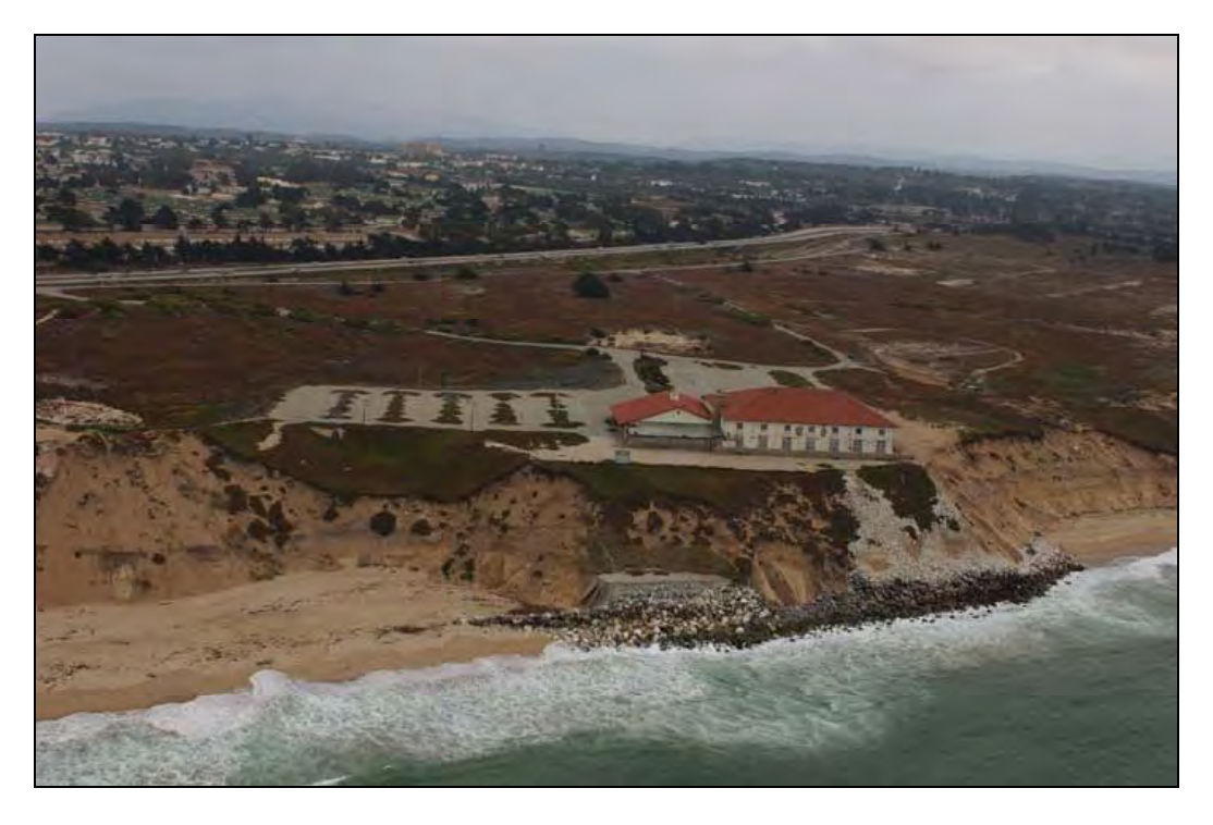
Figure 1a: Oblique aerial photograph of Stillwell Hall in 2002 in Marina, CA. Coastal protection structures placed at the base of the aged building were neither effective nor efficient enough keep up with intense coastal erosion of adjacent bluffs.

Several alternatives have been recognized to deal with the confluence of coastal development and eroding shorelines, none of which are a panacea. In the extreme case, property owners can demolish the building or relocate it landward, either on the same parcel or on an entirely different inland location. Neither of these choices is ideal for property owners, though they should be considered as serious, long-term solutions to this inevitable dilemma, given the rising costs of other alternatives (Griggs 1986). For example, Stillwell Hall, built in the 1940's as the Fort Ord soldier's club in Seaside, California, was torn down in March 2004 because the cost of both coastal armoring and relocating were too high (Figures 1a and b).