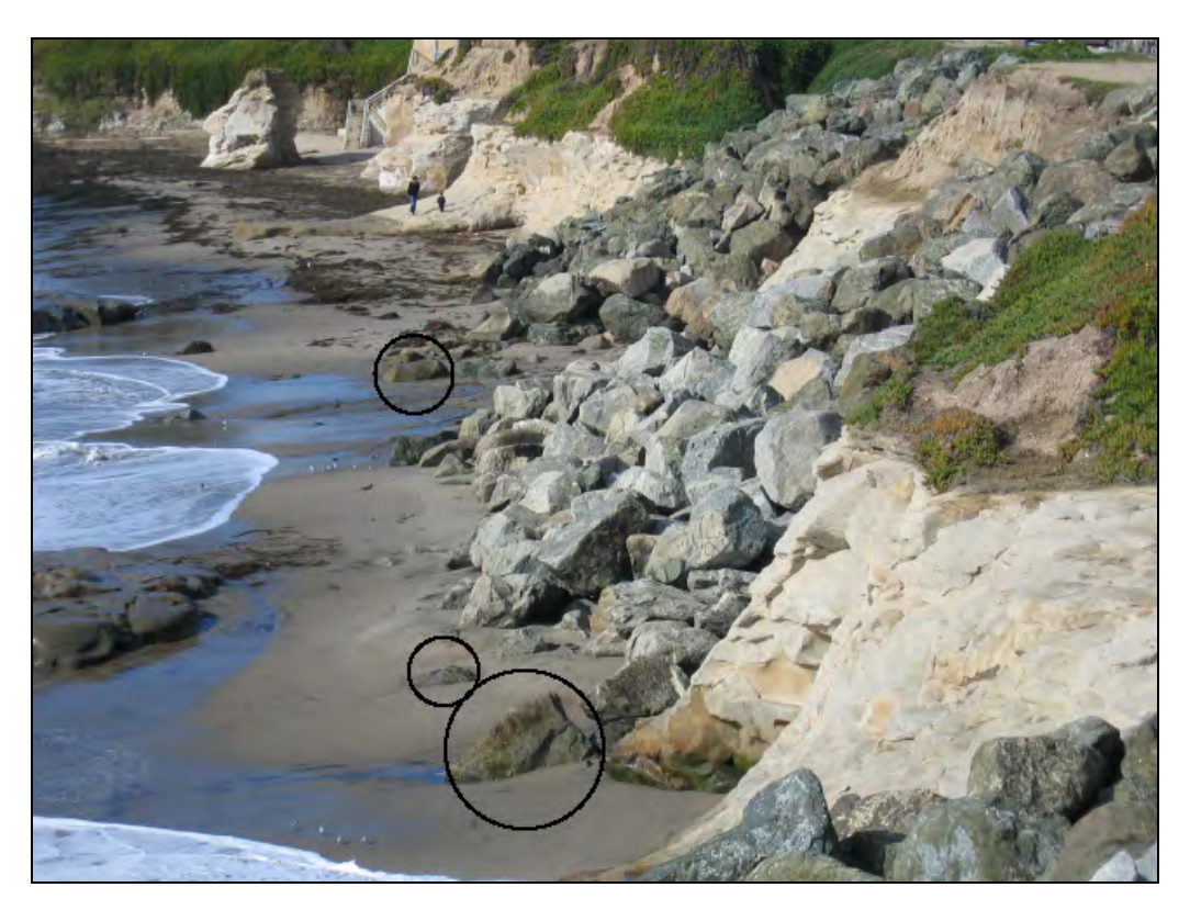
Figure 9: Riprap boulders commonly settle into deep sandy beaches or get buried, as seen here near the intersection of Westcliff Drive and David Street in Santa Cruz, California.