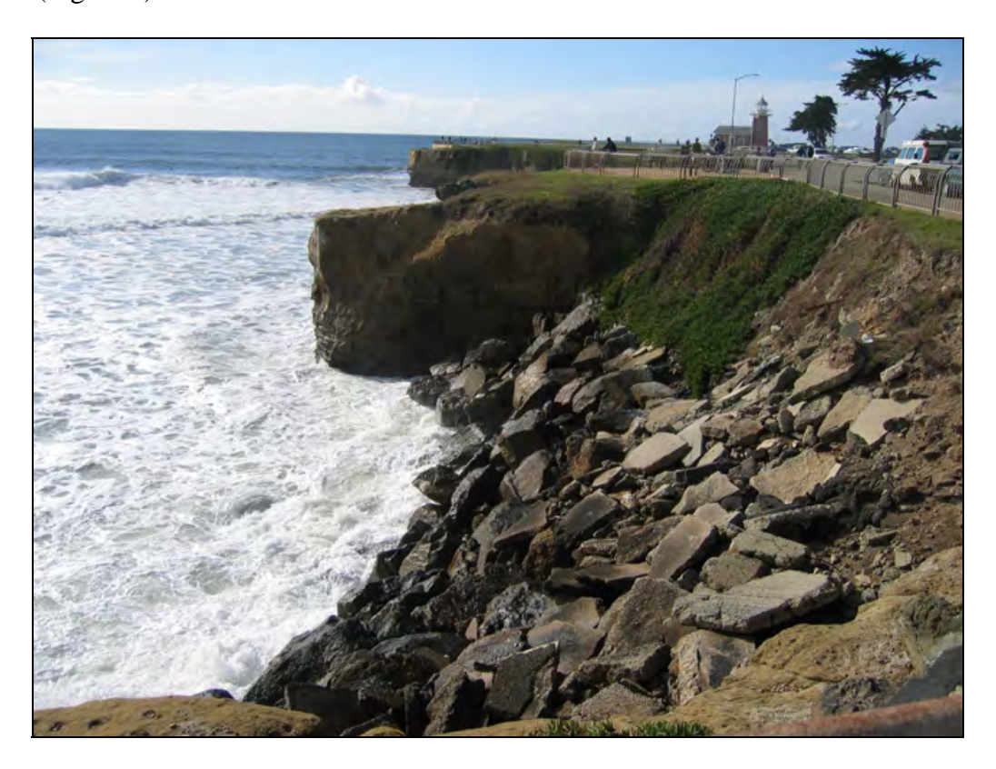
Figure 2: Concrete blocks used as riprap near Lighthouse Point in Santa Cruz, California.

Public outcry over armoring is largely the result of visual impacts, because coastal protection structures often look unnatural or unsightly and can negatively affect recreational beach experiences. In the past, emergency armor has been emplaced with no regard to aesthetics or long-term engineering standards. Slabs of concrete have been dumped at the bases of cliffs, as is the case near Lighthouse Point in Santa Cruz (Figure 2), and several different kinds of structures have been haphazardly used on the same stretch of coast, such as is the case at Opal Cliffs in Capitola (Figure 3).