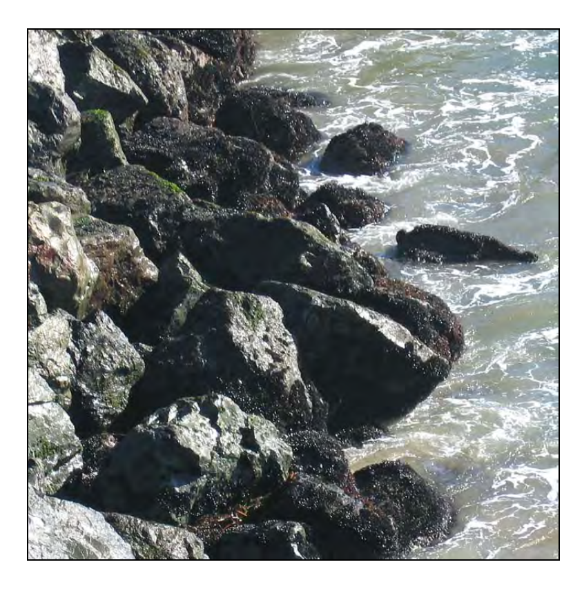
Figure 8: Algae growing on basaltic riprap in Santa Cruz, California. This riprap has covered up a beach, creating an artificial substrate for species recruitment.

In Sydney, Australia, a comparison between organisms living on rocky shores versus seawalls found that seawalls supported only half the diversity of mobile organisms when compared to nearby natural rocky substrates (Chapman 2003). The study found that the types of algae and sessile organisms were similar on both substrates, but that rocky shores were home to more rare species than seawalls. The paucity of mobile and rare organisms may have been due to the steep slopes and lack of rugosity, or microhabitats, used for conventional seawalls. Sculpting coastal armoring structures so that they mimic surrounding landforms may help avoid loss of community diversity.