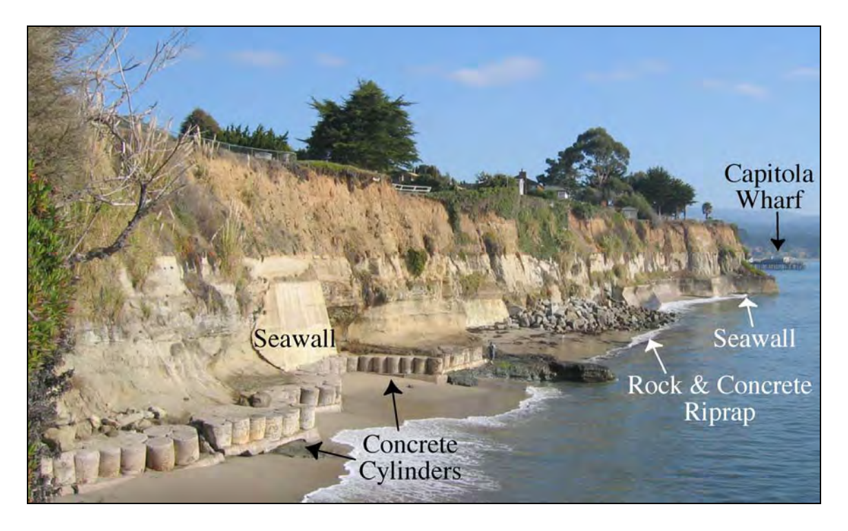
Figure 3: An unplanned assemblage of coastal armoring at Opal Cliffs in Capitola, California can have a visual impact on the beach user.

There are ways to mitigate visual impacts. New seawall engineering, with faces crafted of gunite or shotcrete, can be sculpted and colored to resemble the surrounding cliff or bluff face. Such walls are already used extensively in cliff stabilization on roadways and are gaining further use in the coastal zone, including a new, natural-looking wall protecting the cliff behind Cowell's Beach in Santa Cruz (Figure 4).