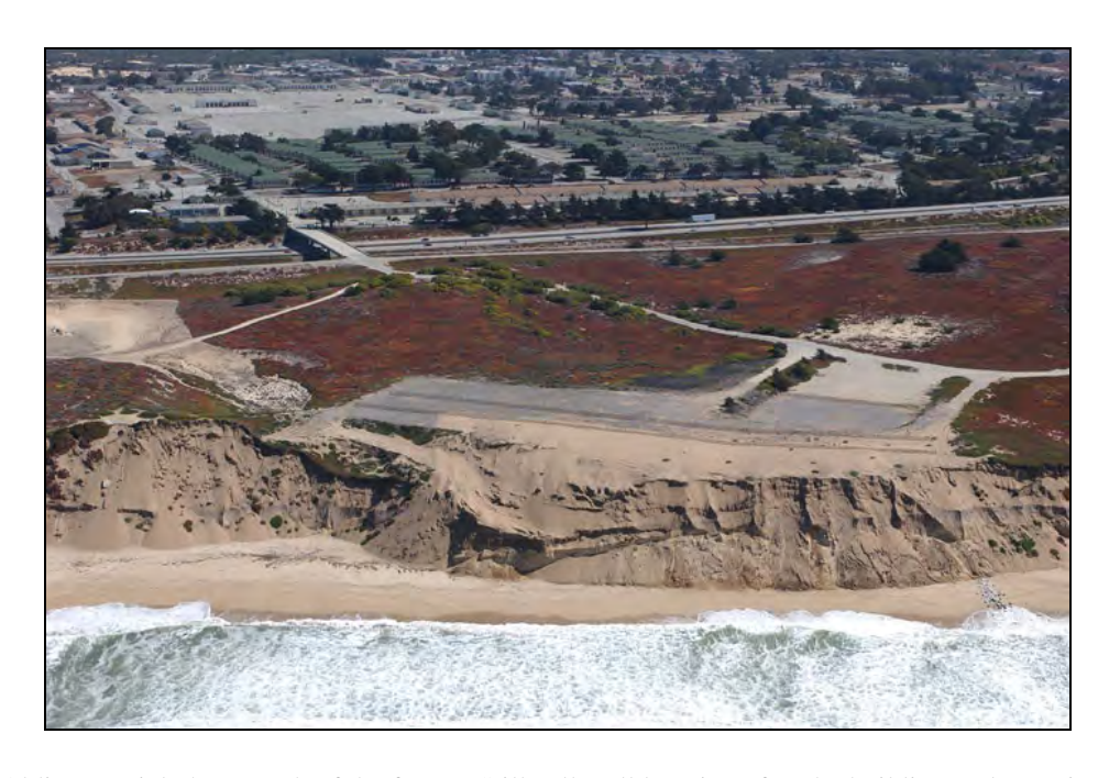
Figure 1b: Oblique aerial photograph of the former Stillwell Hall location after the building and associated coastal protection structures were removed in March 2004.

Beach nourishment has been highlighted recently as a solution to coastal erosion; proponents of this alternative maintain that increasing beach width by physically adding sand to a beach buffers wave energy and slows retreat rates. Federal, state and local government agencies are pursuing this method as a way to protect property from erosion damage, but the costs are generally very high and the net, long-term benefits of beach nourishment will vary greatly depending on local conditions (Leonard et al. 1990).