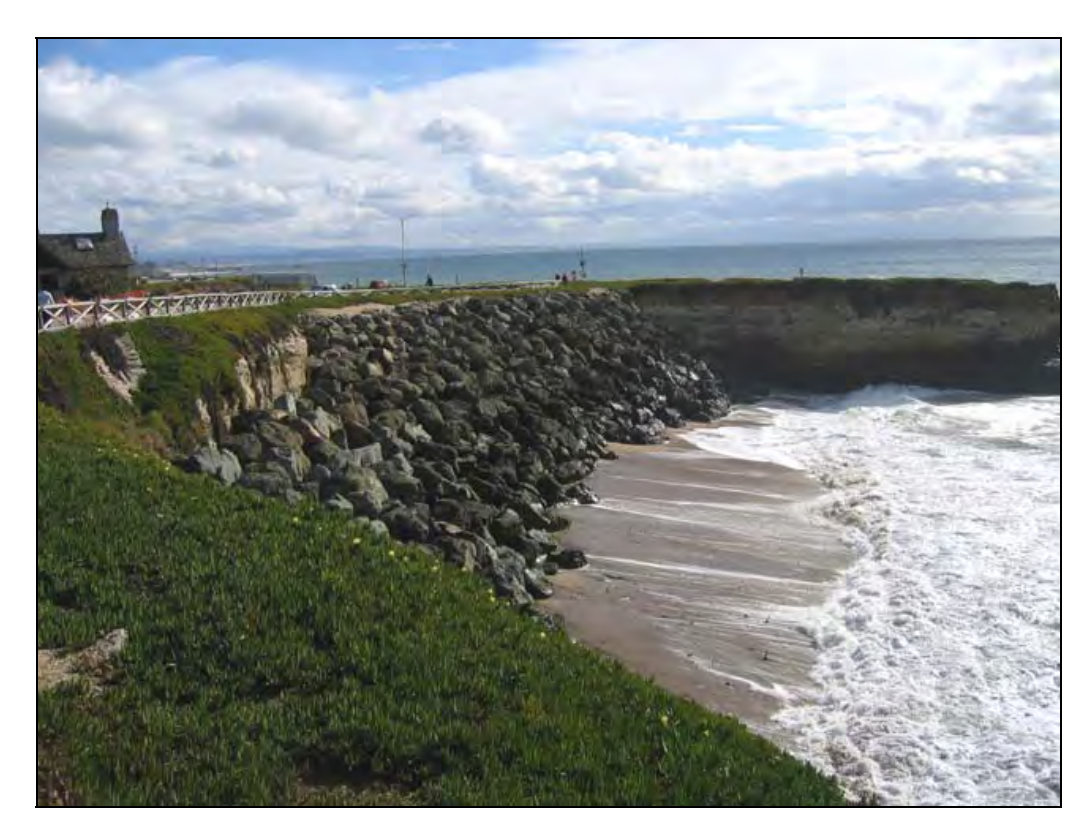
Figure 5: Riprap covering up significant amount of beach area in Santa Cruz, California, near the intersection of Westcliff Drive and San Jose Avenue.

by the shore-parallel length of the riprap yields the square feet of beach lost by impoundment. In this case, if a 20-foot stretch of coast needed to be armored, an average seawall would impound 120 ft<sup>2</sup> of beach (6 ft wide x 20 ft long), while riprap would cover 800 ft<sup>2</sup> of beach (40 ft wide x 20 ft long). Westcliff Drive in Santa Cruz, for example, has had extensive beach loss because of riprap emplacement (Figure 5).