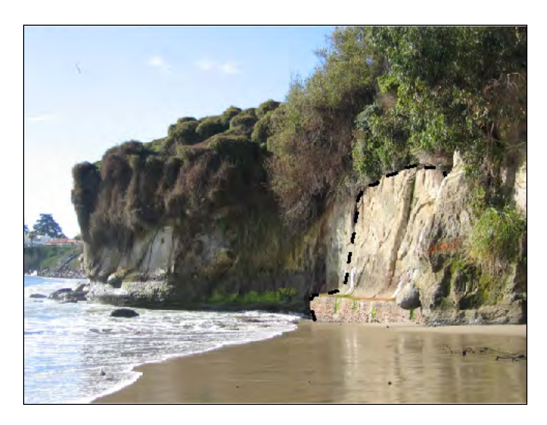
Figure 4: Photograph of cliff stabilization built to fill a seacave at Cowell's Beach in Santa Cruz. The 2004 gunite wall, outlined by the black dashed line, mimics the shape and color of the natural cliff.

The Commission, in compliance with section 30253 of the Coastal Act (2005), requires that a licensed civil engineer, who has experience in coastal processes, design new armoring structures. This has helped to reduce the number of shoddy, unregulated structures. One solution to the problem of unattractive, incongruent armoring being considered by the Commission is to plan a continuous, uniform coastal protection structure that spans across several parcels to ameliorate a regional erosion problem (Griggs and Fulton-Bennett 1988).