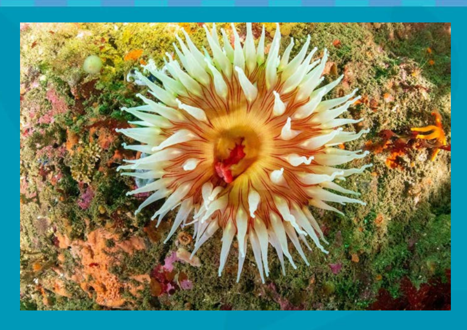
For more information: sanctuaries.noaa.gov/chumash-heritage/