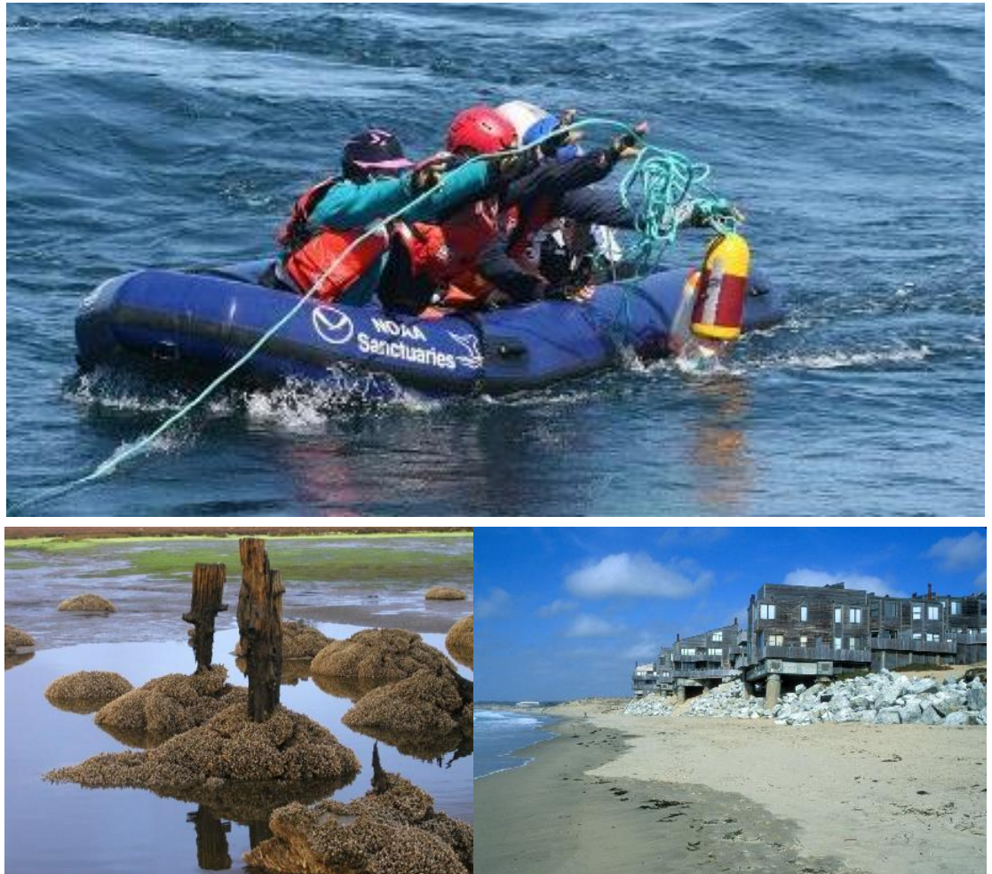
(Top) Members of the West Coast Entangled Whale Response Network practice their line grappling and release techniques. (Bottom, left) Example of invasive Bryozoan surrounding pier pilings in Elkhorn Slough. (Bottom, right) Coastal armoring on Del Monte Beach.