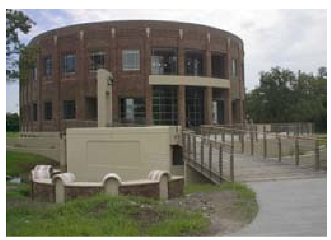
Hollings Marine Laboratory at Fort Johnson