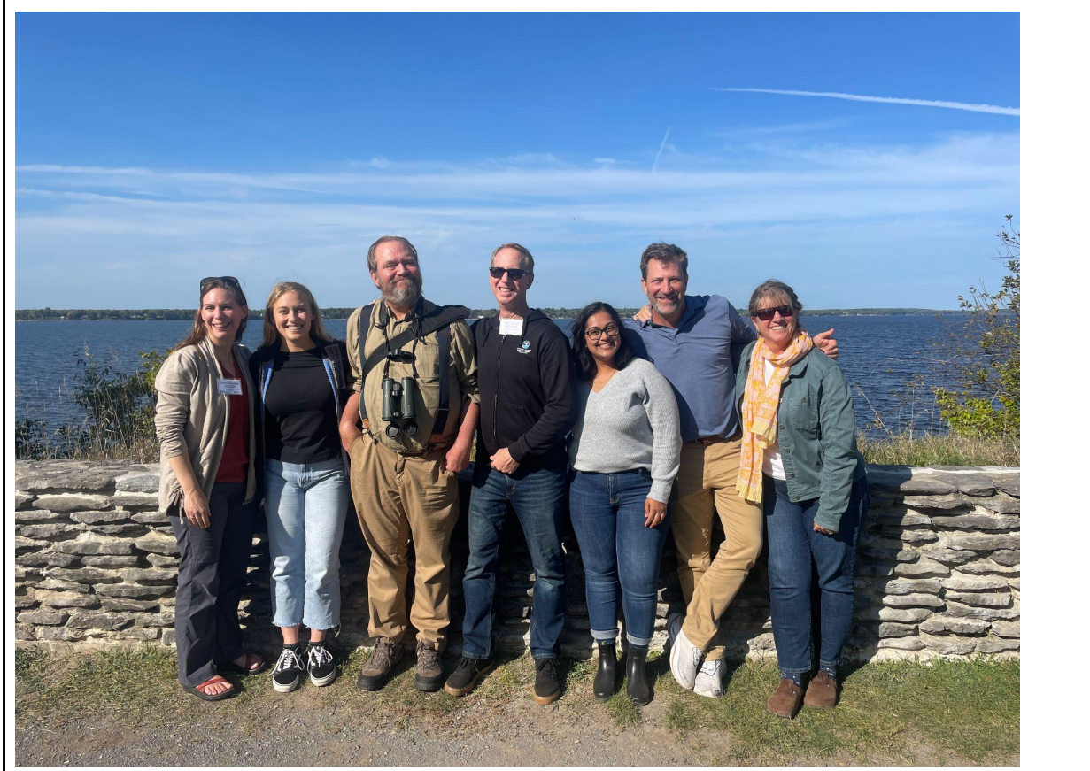
Pictured are the Monterey Bay, Greater Farallones, Cordell Bank, Channel Islands National Marine Sanctuary Advisory council chairs and coordinators.