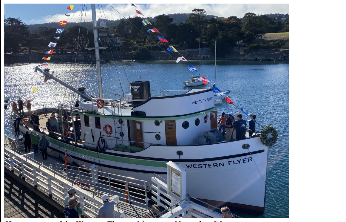
Homecoming of the Western Flyer to Monterey, November 5th.