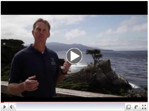
Pebble Beach and MBNMS