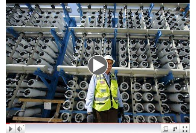
concerns regarding water rights issues, and if the slant wells may draw groundwater from their aquifers.

In addition, staff invited the US Army to participate in a presentation on the main topics covered in the Environmental Impact Statement, as some of the water transmission lines cross US Army property along the Monterey Peninsula. Staff and consultants offered insights on how impacts were determined and answered a myriad of questions about how to find information in the over 4,500 page document, including appendices. Public meetings were conducted on February 15 and 16, as well as a SAC presentation on February 17.