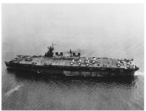
USS Independence (CVL-22) was scuttled near the Farallon Islands in 1951 after being a target for atomic bomb testing and contained barrels of radioactive waste.

A third species of sponge, Farrea aculeata (Schulze), also found on the USS Independence, was only previously known to occur north of California. Dr. Henry Rieswig from (RBCM) is currently performing the measurements and imaging to describe the two new sponge species, and report the range extension and update the taxonomy of Farrea aculeata, since it was only described once, in 1899.