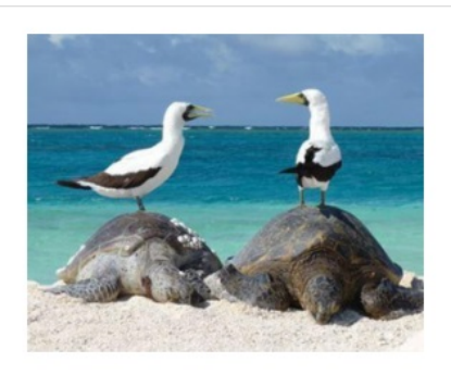
Past, Present, Future

Sea to Shining Sea - The National Marine Sanctuary System's Newsletter