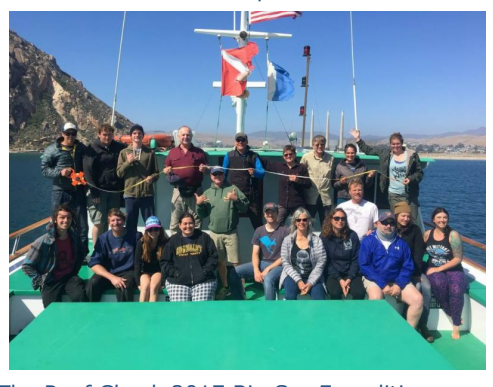
The Reef Check 2017 Big Sur Expedition Divers on the Vision. The results of the surveys can be viewed and interpreted \underline{\text{here}}