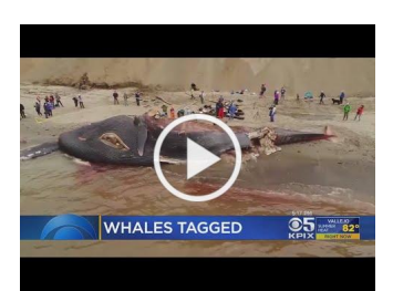
Researchers Hope Whale Tagging Can Reduce Ship Strikes In SF Bay

Since May 6 an unusual cluster of dead whale strandings has occurred in Greater Farallones National Marine Sanctuary and adjacent waters. Of five dead whales, four were due to shipstrike and/or line entanglement. Although most involved gray whales, two were fin whales, an endangered species not commonly encountered nearshore. The location and source of the strikes or entanglement remains unknown. One fin whale rode into San Francisco Bay on the bow of a ship: the strike could have occurred anywhere between ports. The Greater Farallones and adjacent sanctuaries are major feeding sites for endangered whales such as blues, fins, humpbacks and others. Greater Farallones, Cordell Bank, researchers, the shipping industry and others are working together to reduce human-caused whale deaths. In 2013 shipping lanes were changed, and a voluntary ship speed reduction program is in effect throughout feeding season, late spring into fall. Greater Farallones NMS is the gateway to several major shipping ports in the San Francisco Estuary system. Reducing anthropogenic wildlife impacts of all kinds is a major sanctuary challenge and concern. MORE INFORMATION