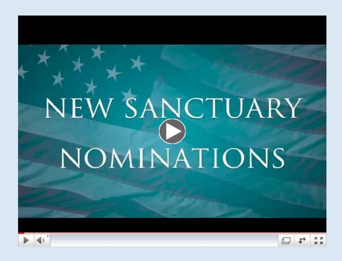
National Marine Sanctuaries: Invest In Your Future

Monterey Bay National Marine Sanctuary (MBNMS) is a Federally protected marine area offshore of California's central coast. Stretching from Marin to Cambria, the MBNMS encompasses a shoreline length of 276 miles and 6,094 square miles of ocean. Supporting one of the world's most diverse marine ecosystems, it is home to numerous mammals, seabirds, fishes, invertebrates and plants in a remarkably productive coastal environment. The MBNMS was established for the purpose of resource protection, research, education, and public use of this national treasure. The MBNMS is part of a system of 13 National Marine Sanctuaries and one marine national monument, administered by the National Oceanic and Atmospheric Administration.