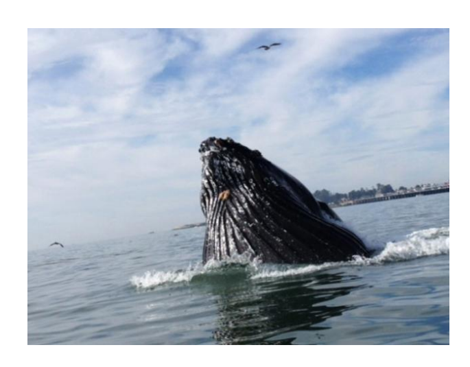
Humpback whales are crowding close to shore this summer in search of food.