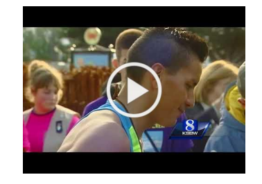
Monterey Bay Half Marathon 2017

Monterey Events MONTEREY BAY HALF MARATHON NOVEMBER 11, 2018