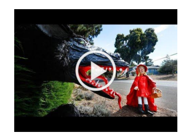
Hundreds of scarecrows return to the streets of Cambria for 2018's festival