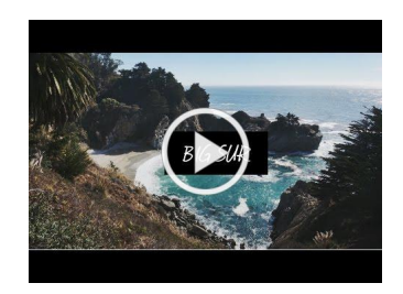
Big Sur River Run October 5 - 7, 2018

Big Sur Events Big Sur River Run October 5 - 7, 2018