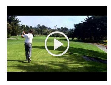
Taylormade Invitational Pebble Beach-

Pebble Beach TAYLORMADE PEBBLE BEACH INVITATIONAL NOVEMBER 12 - 18, 2018