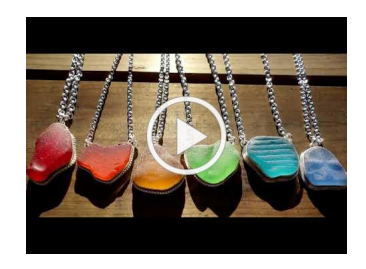
The Best of Santa Cruz Sea Glass jewelry

Santa Cruz Events Santa Cruz Sea Glass & Ocean Art Festival November 4 and 5, 2018